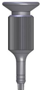
Torx head hand screwdriver Art.-No. 45100